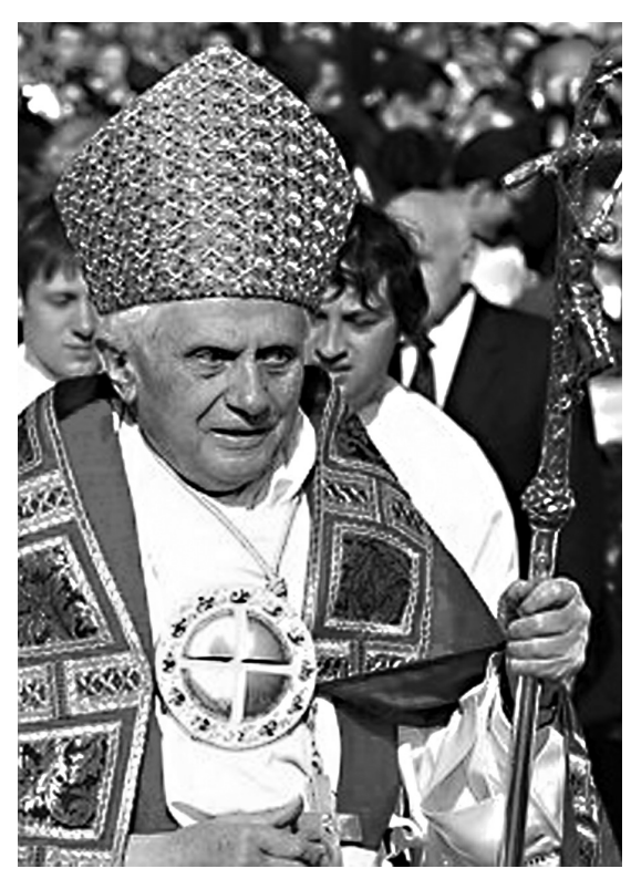
Pope Benedict XVI.

still stands one's own conscience, which must be obeyed before all else, if necessary even against the requirement of ecclesiastical authority."