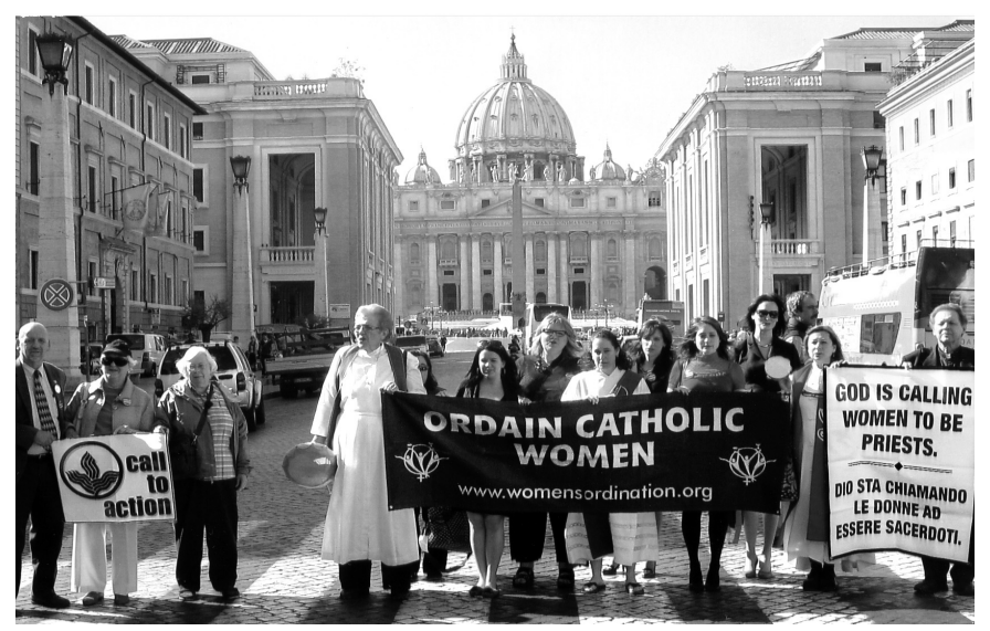
International delegation advocating women's ordination in St. Peter's Square, Vatican City, October 2011

was being told, as adults, that they were not allowed to even discuss the issue of ordaining women. One longtime Catholic said, "The last time I was told I could not discuss something, I was five years old." Others asked, "Hasn't the Pope heard of freedom of speech?"