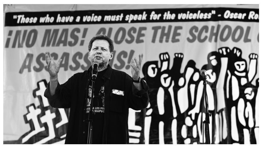
Addressing the Saturday rally at the annual November vigil.

the SOA and U.S. foreign policy in Latin America, I was introduced to an injustice much closer to home—in my own faith community.